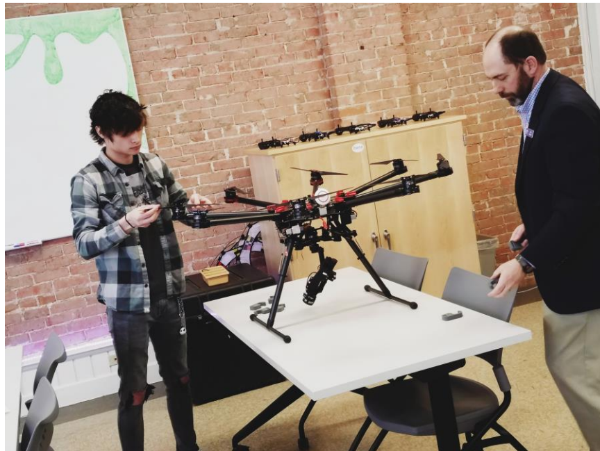
A student at Roscoe Collegiate High School , a Global Learning Network World-Leading Learner school, works on a drone.