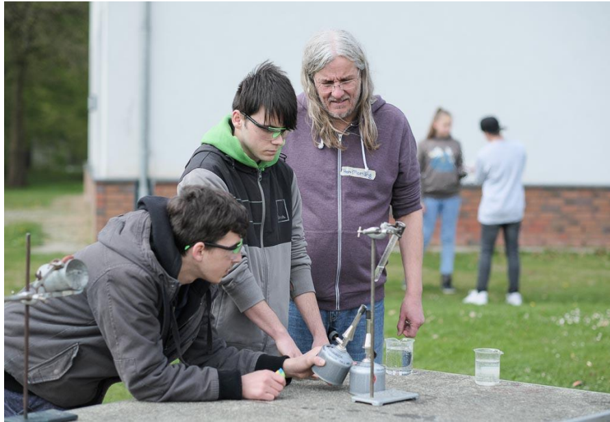
Students work collaboratively outdoors at Freiherr-vom-Stein-Schule Neumünster , a school in Germany designated as a Global Learning Network World-Leading Learner.

Building on findings and recommendations from the National Research Council 29 and their investments in a variety of school improvement efforts over several years, the William and Flora Hewlett Foundation argues that “students need a combination of cognitive, interpersonal, and intrapersonal competencies, and they must be able to use their knowledge and skills to solve novel problems.” 30