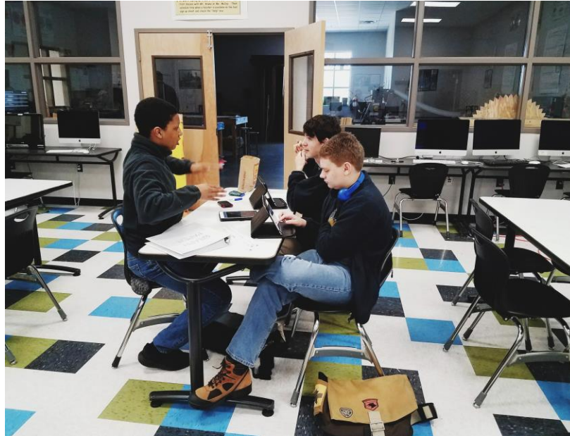
Students at the STEM School Chattanooga , a Global Learning Network World-Leading Learner, collaborate on an urban design project for one of the school's industry partners.

participation in postsecondary education, and civic and life success. After all, many of the skills defined by employers (e.g., communication, collaboration) are also keys to completing industry certifications and higher education degrees and to enabling individuals to meaningfully contribute as employees and citizens. v