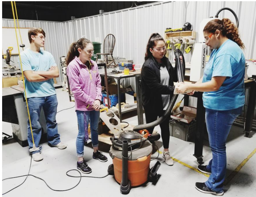
Students from the Roscoe Collegiate High School in Texas work in the school’s hands-on learning lab. Students at the school can earn postsecondary credentials while still in high school.