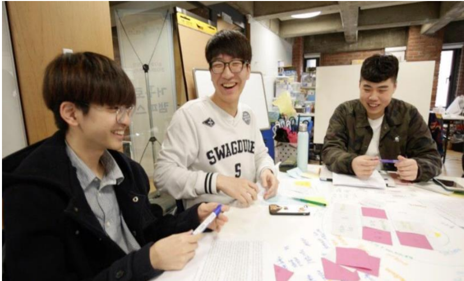
Students collaborate at the FCN Learning Lab , a Global Learning Network World-Leading Learner school in South Korea.

While there are many frameworks and ways of categorizing and defining the needed skills, we propose that employer and community demands for skills be considered in three broad categories, regardless of the framework: